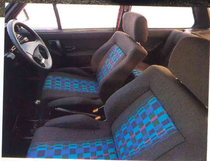
G40's stylish looks are reflected in its sporting interior

wheel, too. There seems to be plenty of rear seat room, given the Polo's small overall dimensions and the boot is decent, too.