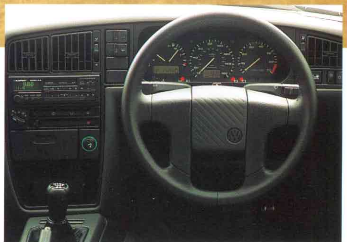
Instrumentation is clear and switchgear logical

Engine 1781cc, supercharged, 4cyl, 180bhp Performance 140mph, 0-60mph 7.3sec Mpg at 56mph 46.3 Equipment Central locking, adjustable driver's seat, trip computer, power steering, split/fold rear seat, stereo radio/cassette, alloy wheels, electric door mirrors, electric windows, internally adjustable mirrors, sunroof