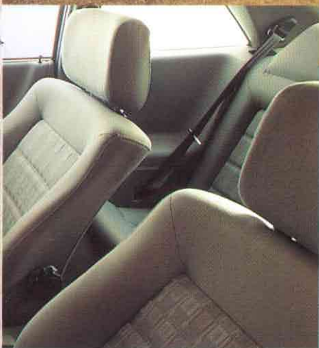
seats are supportive