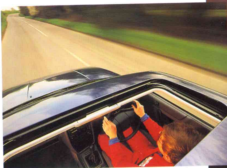
G60 at speed feels solid on the road and very precise

It handles very neutrally and very securely — even lifting off in mid-corner just makes the